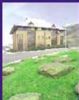
Raven Head Office, Bradford

Established in 1982, Raven Computers is one of the UK's leading providers of Microsoft-based solutions and Internet technology. Our success is based on our exceptional skills base and commitment to selecting and integrating best-of-breed, cutting-edge technology.